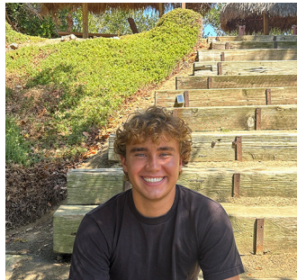
Leyton G. Entertainment Editor, Column Writer